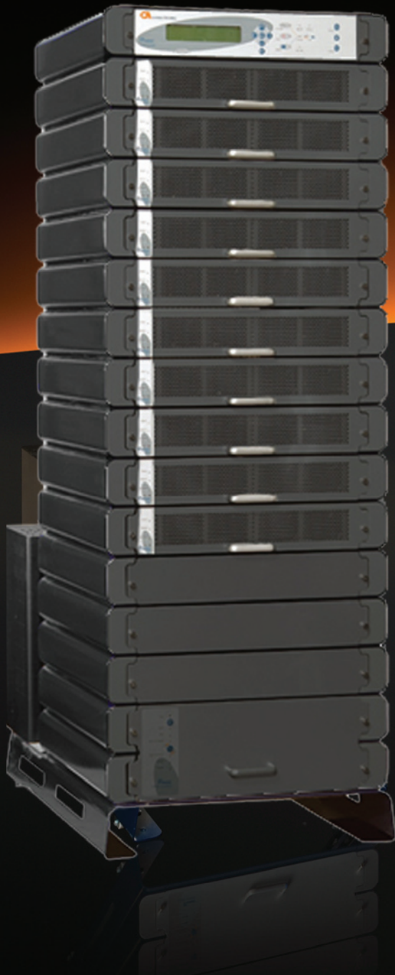
Power+ AC to AC Efficiency